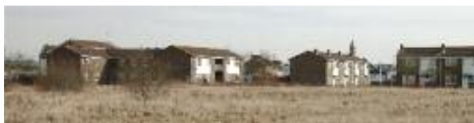
Properties at risk of flooding