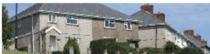
Properties exposed to high levels of wind and rain