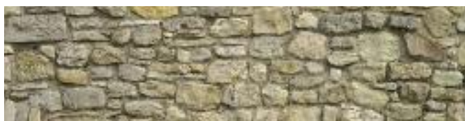
Random stone houses