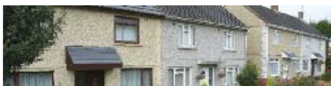
Narrow, variable width and standard cavities