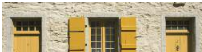
Houses with no damp proof course or defective wall ties