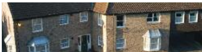
Occupied housing stock

Ideal for the following hard to treat homes (subject to survey)