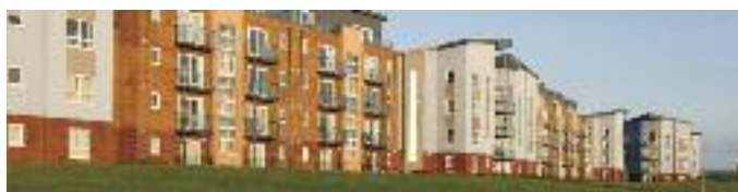
Buildings more than three stories high